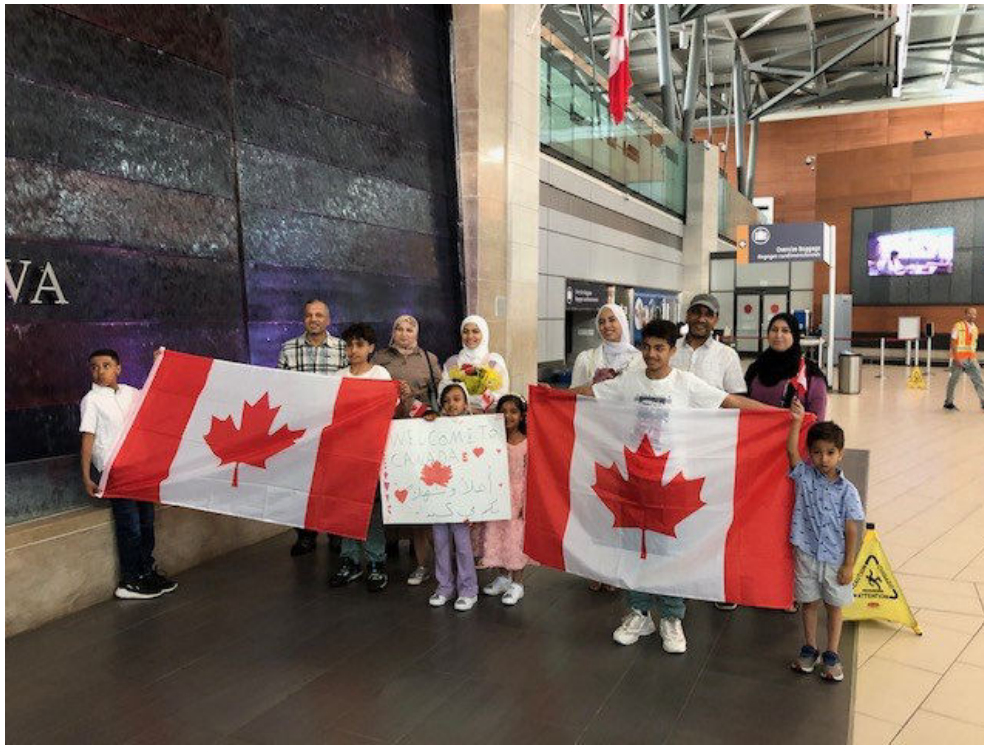
A warm welcome - After several years of separation, two new Syrian families are happily reunited with their relatives in Ottawa. All four families were sponsored by the St. Joseph's Refugee Outreach Committee.